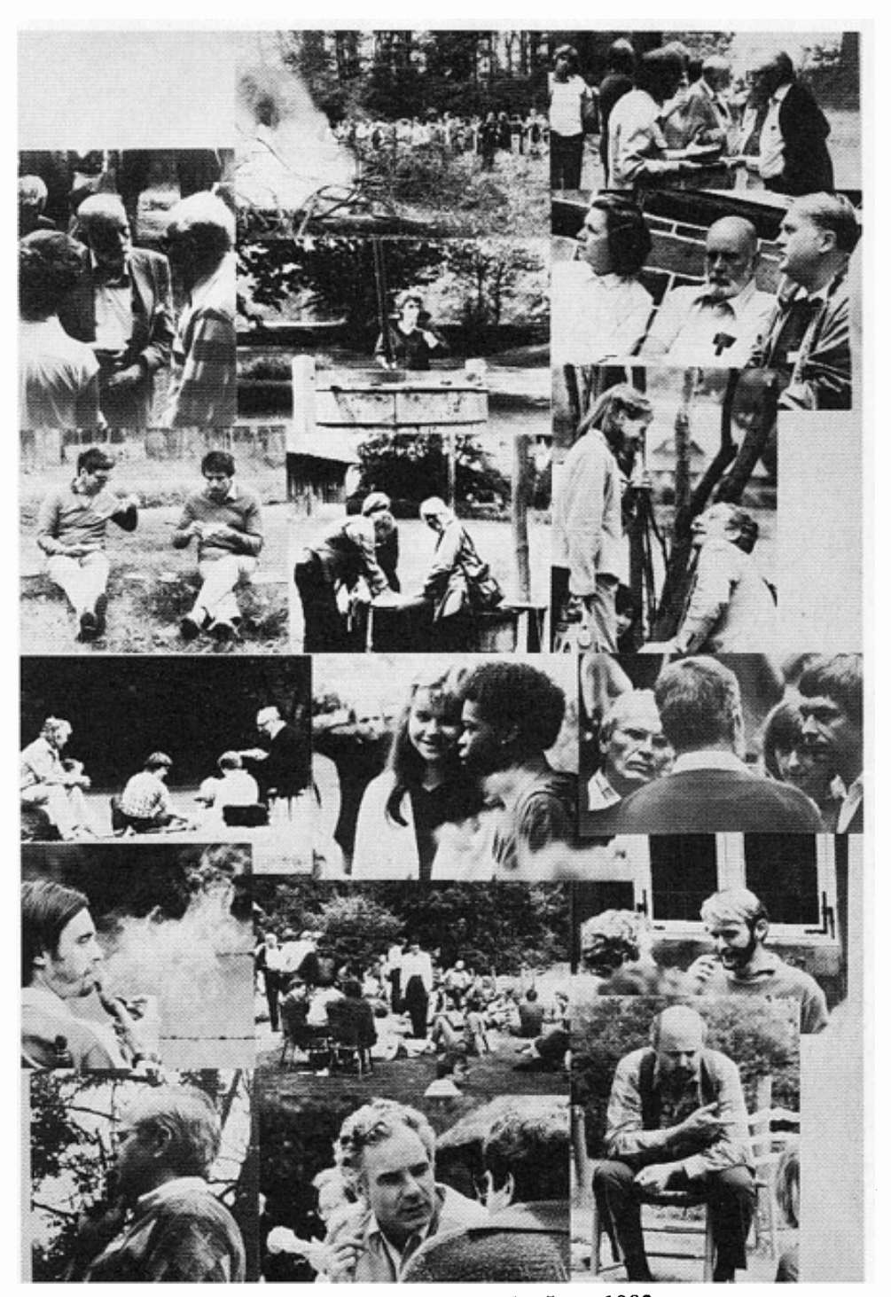
Personal and scientific discussions in Wilsede, June 1982